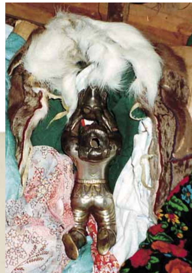
A girl-shaped rhyton amid robes and a coat made of reindeer fur

In addition, for temporary replacement of the sacrificial victim, people often used metal figurines, which they purchased from merchants, e.g., a cooper horse-lock and two deer (the second half of the 19th century). In the Mansi village of Hoshlog, we found a copper horse with a little bell on its neck together with a silver saucer made in Moscow in 1830 and copper and silver coins of the 1840–1890s. The items were wrapped in a silk kerchief. Thus, the temporary sacrifice to the guardian spirits was amplified by extra offerings.