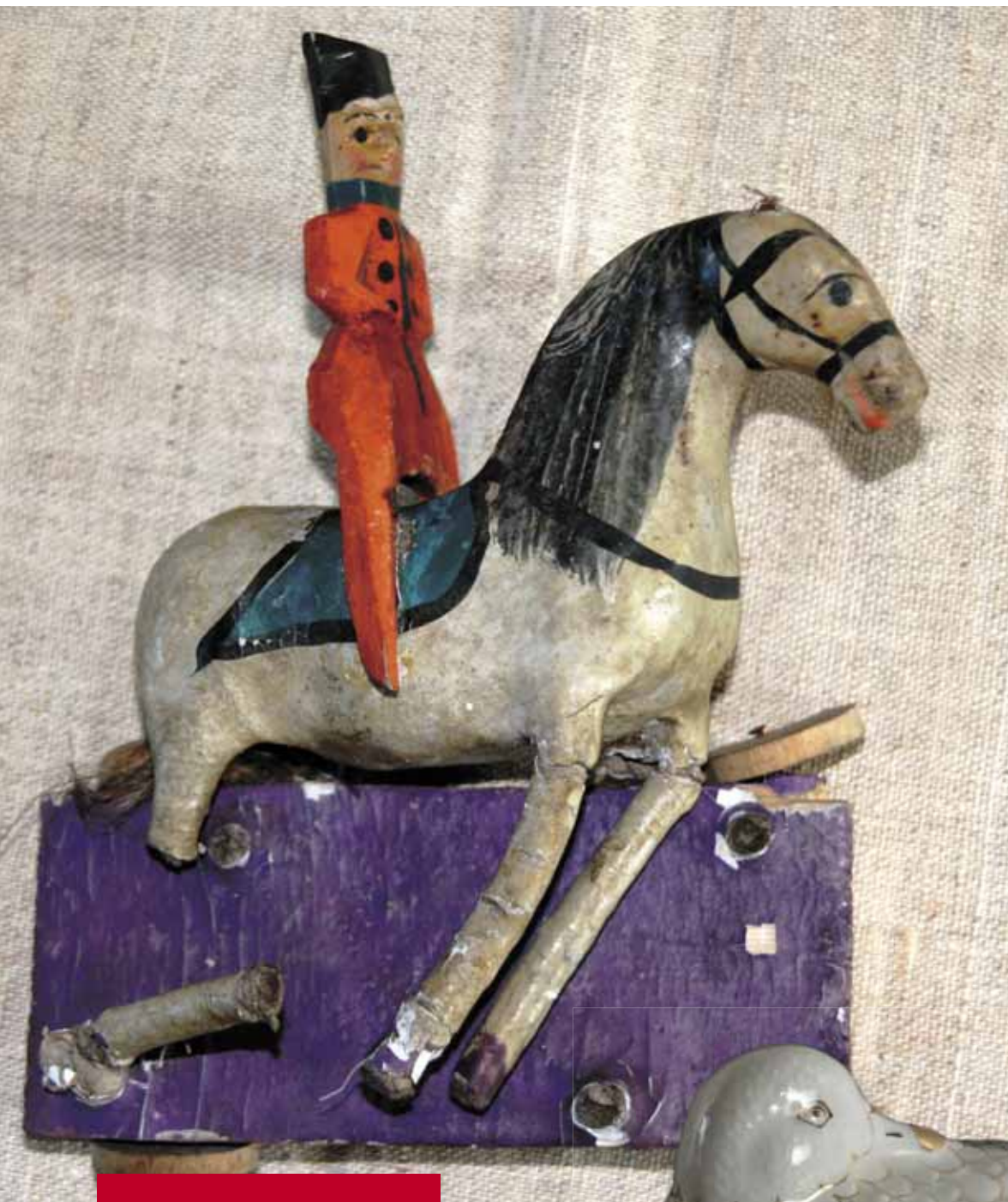
An equestrian made of papier-mâché Bottom: A duck-shaped porcelain salt-cellar, a cult attribute of the Mansi