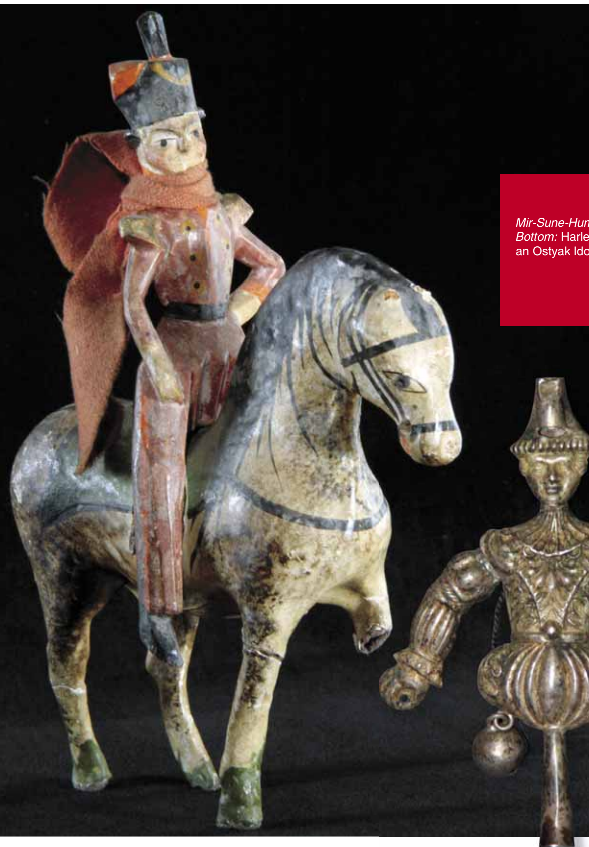
Mir-Sune-Hum. Bottom: Harlequin, an Ostyak Idol

include an “ancient wooden Russian toy,” which was used to personify the family guardian spirit of the Ob-Ugric people. At the end of the 19th century, the Tavda Voguls had a guardian goddess described as follows: “A woman shaped as a nesting doll; a woman shaped as a Vogul doll; a woman with fiery hands; a woman with flaming hands; our old grandmother.”