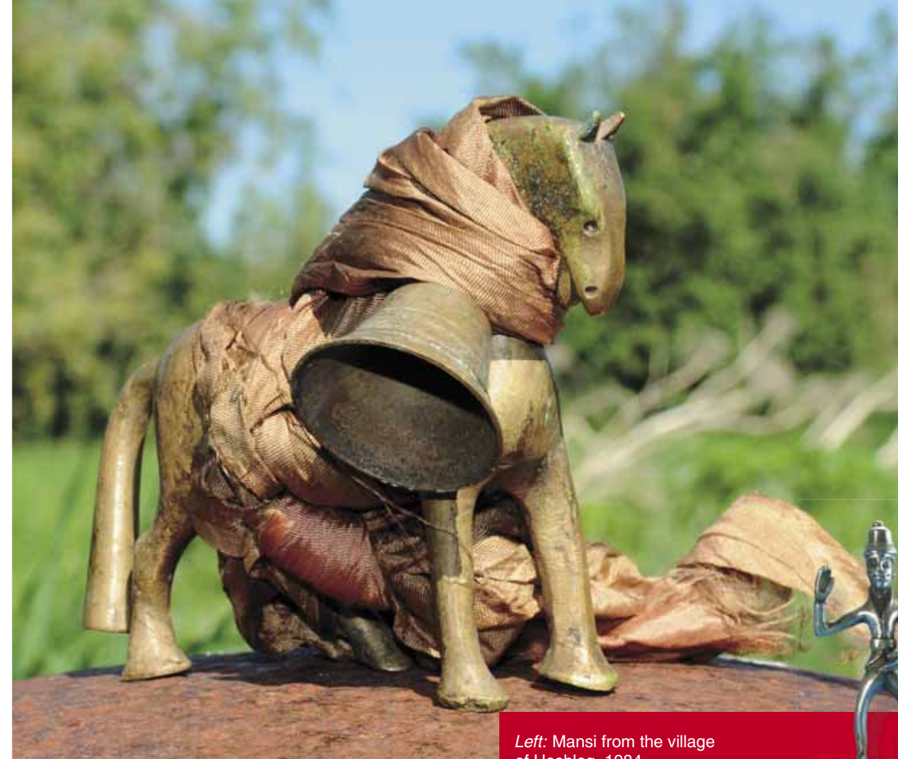
Left: Mansi from the village of Hoshlog, 1984. Top: A cooper horse