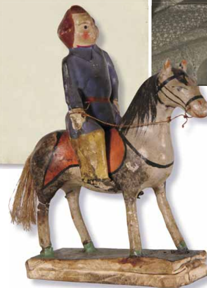
figure with a silver male figurine inside; the figurine was cast in Tobolsk in the early 19th century. A similar figurine played the role of a guardian spirit with Khanty families from the Polui River; this figurine was dressed in a miniature silver brocade robe.

Not long ago, in the village of Suevat Paul in the Sverdlovsk oblast, researchers found in the attic of an old Mansi house a porcelain figurine of a dancing girl wearing seven kerchiefs; the figurine symbolized Kaltas'ekva , the Mansi's main female deity. The Lyapin Mansi kept in a sacred chest a glass Christmas toy shaped as a girl wearing a sundress; the purpose of this toy is, however, unknown.