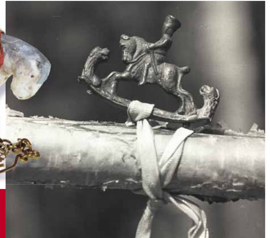
Silver figurine of an equestrian