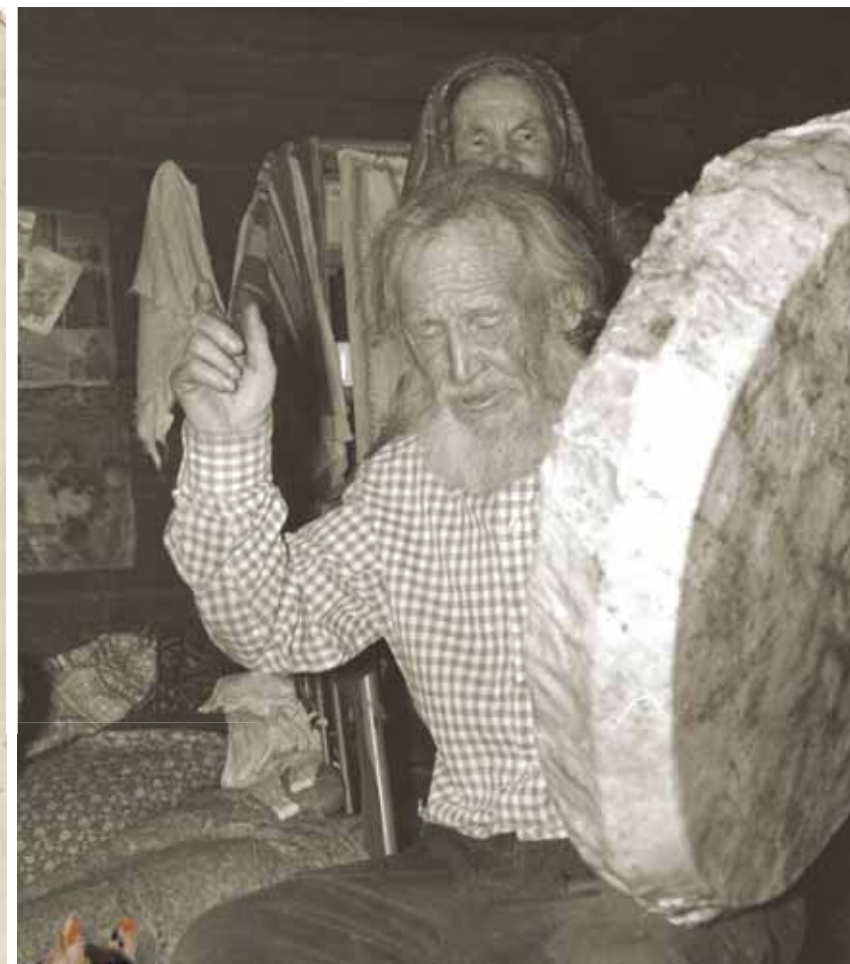
A shaman with a tambourine, 1989. An equestrian made of papier-mache