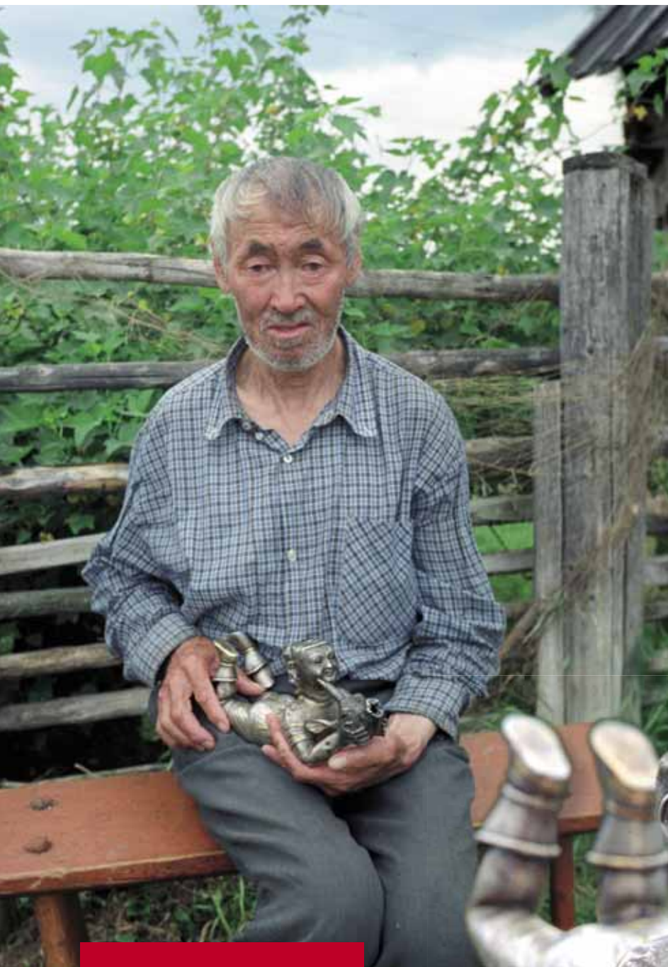
The owner of a home shrine with a figure of the guardian spirit. Right: A figured rhyton (the 8th or early 9th century, Central Asia) shaped as a girl carrying the head of an antelope in her hands—a guardian spirit of Khanty families