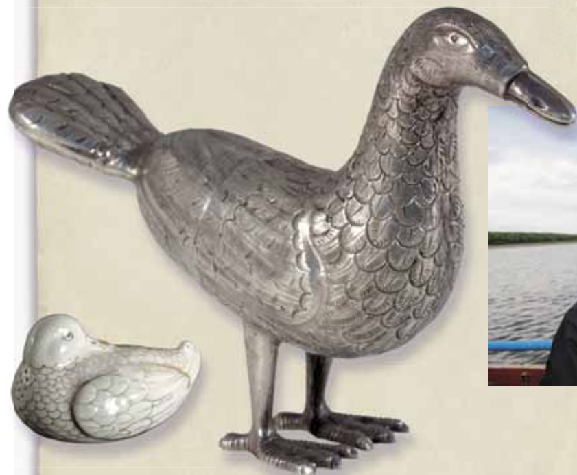
A silver statuette of a goose, the core of the figurine of the Mansi's guardian spirit, and a porcelain salt-cellar shaped as a duck, a cult attribute of the Mansi