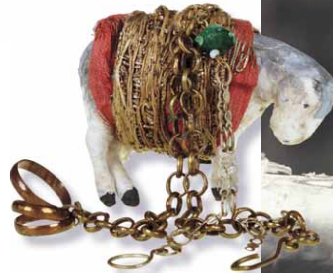
Tribute (a donkey)