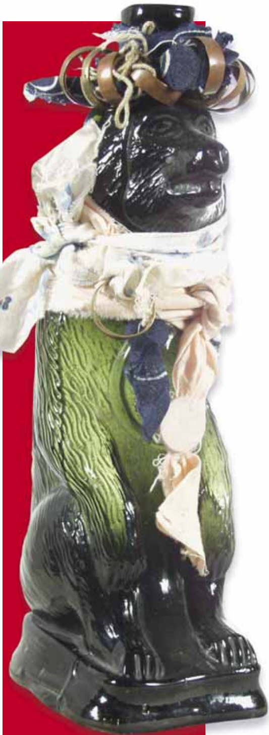
A figure of the supreme deity in the shape of a bear. Right: Tribute (a horse)