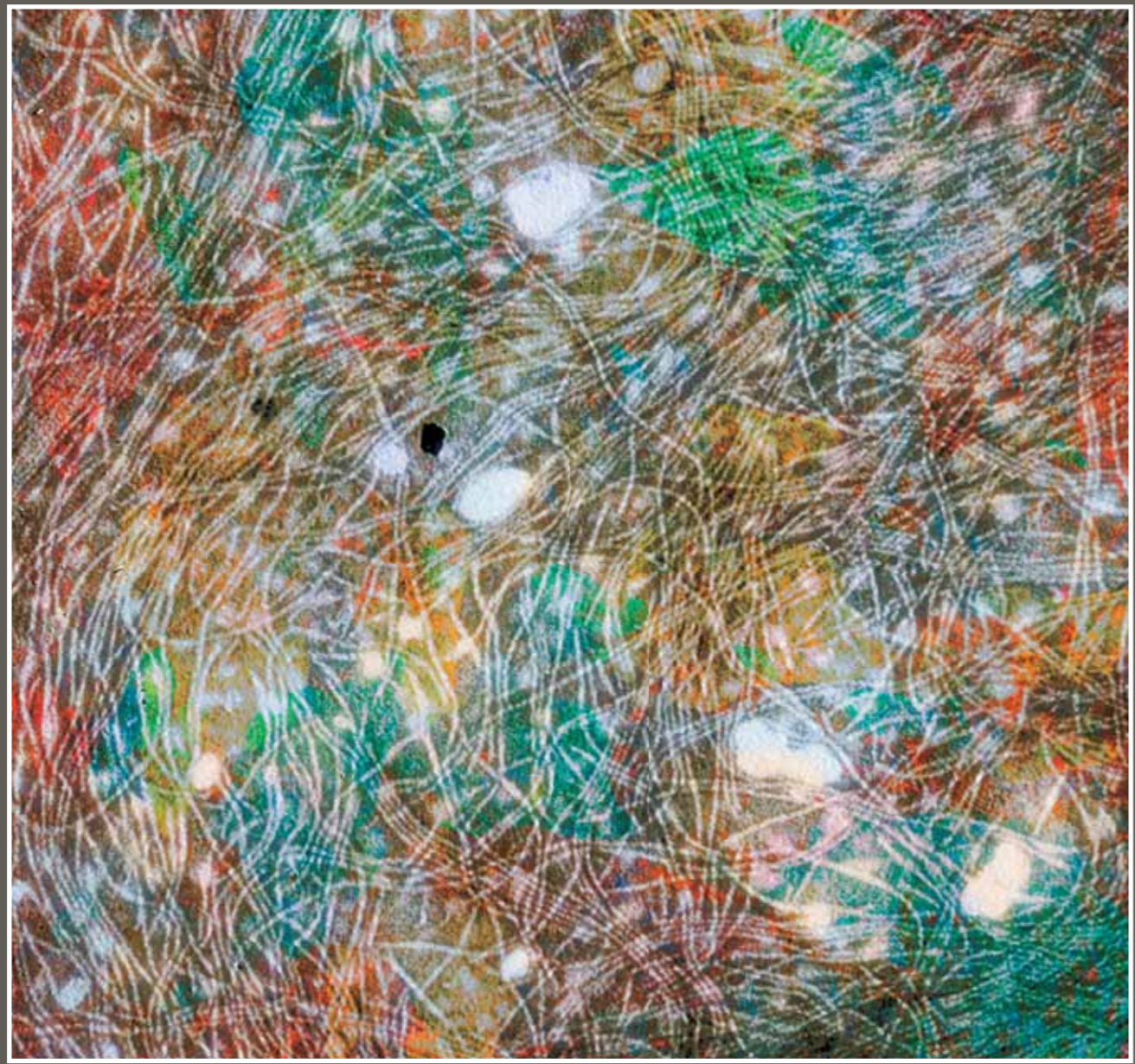
This is how a filamentous bacteriophage looks like after counterstaining with phosphotungstic acid in the field of vision of a Jem 1400 (JEOL, Japan) electron microscope