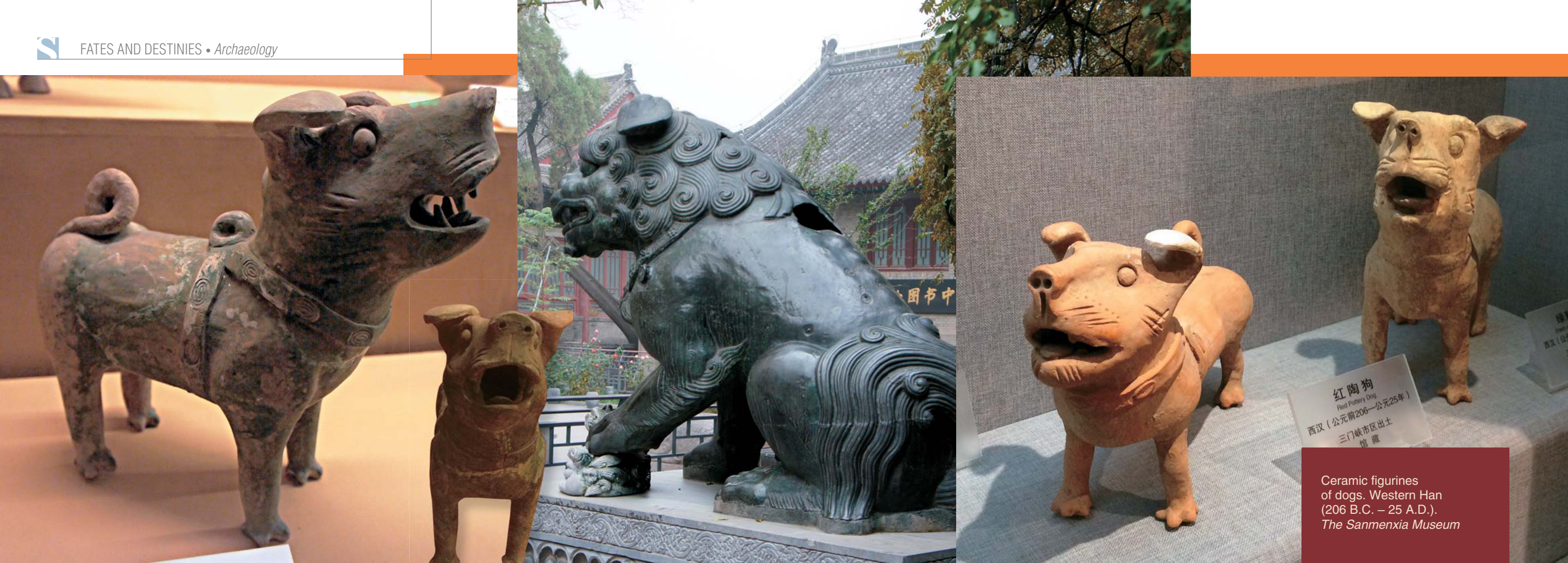
Ceramic figurine of a dog. Eastern Han (25–220 A.D.). The Shaanxi History Museum

The appearance the dogs depended on their purpose. The inhabitants of the peninsular divided the dogs into «military» and «civilian.» The former group included statues warding off evil spirits (guardian spirits of doors, villages, towns, etc.) and statues «supporting the Buddhist dogma.» The latter group united the rulers of wind and rain, deities responsible for fertility, childbearing, richness, and longevity.