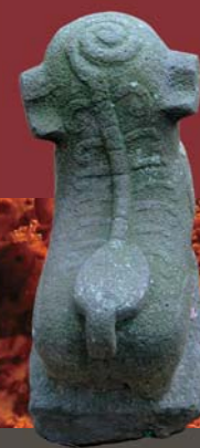
The photographs are the courtesy of the authors and A. Soloviev