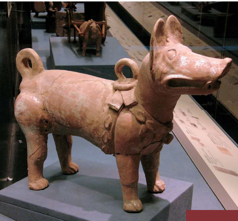
Ceramic figurine of a dog. Eastern Han (25–220 A.D.). The Capital Museum, Beijing