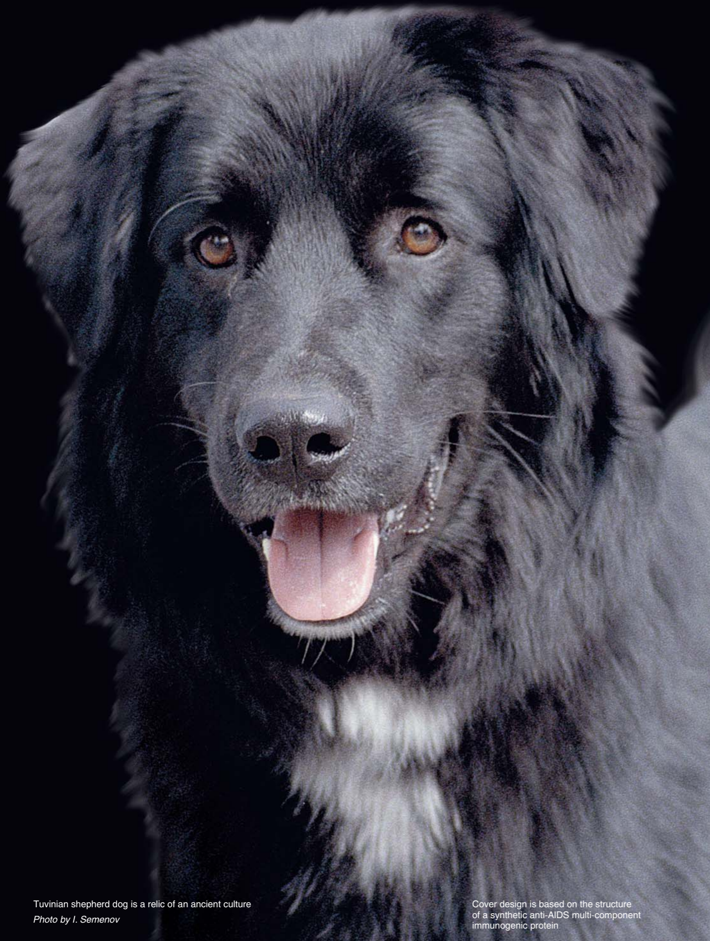
Tuvian shepherd dog is a relic of an ancient culture